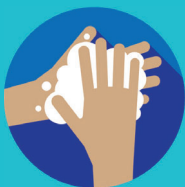
SCRUB: 20 SECONDS